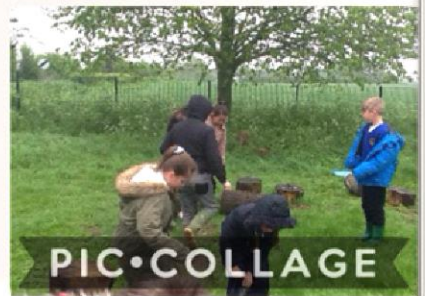
Worm Chanting, Bug Hunting, Enjoying Mud and Making Wooden Necklaces.